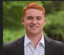
Hayden Hovis Committee